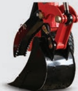
12" or 18" Bucket with Mechanical Thumb