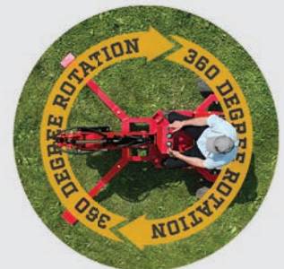
360 Degree Rotation