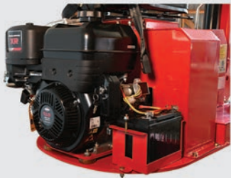
Briggs & Stratton Gasoline Engine