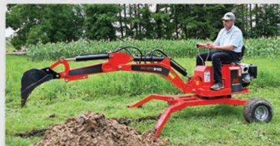
Curved Boom Design