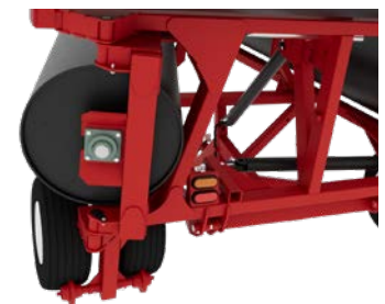
3" DRUM SHAFT & BEARING