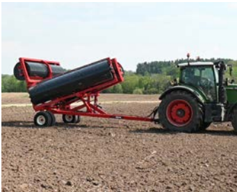
FORWARD FOLD DESIGN