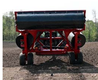
NARROW TRANSPORT WIDTH