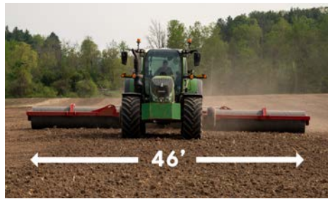
34' - 46' WIDTHS