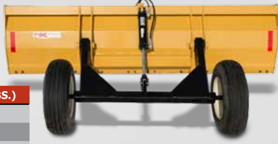
LLR-8 model shown